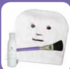
Facial Treatment Kit

(a,b) Sanitizing Spray; (c-e) 4 oz. Paraffin Treatment Cream; (f) 8 oz. Paraffin Treatment Cream